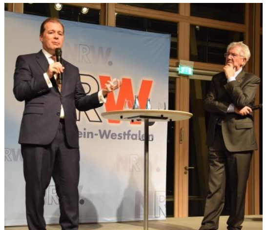
Marc Speich, Secretary of State for Federal and European Affairs of NRW briefing the Congress' participants.

Europe reveals itself to be very young when Eastern and Western perspectives are shared and