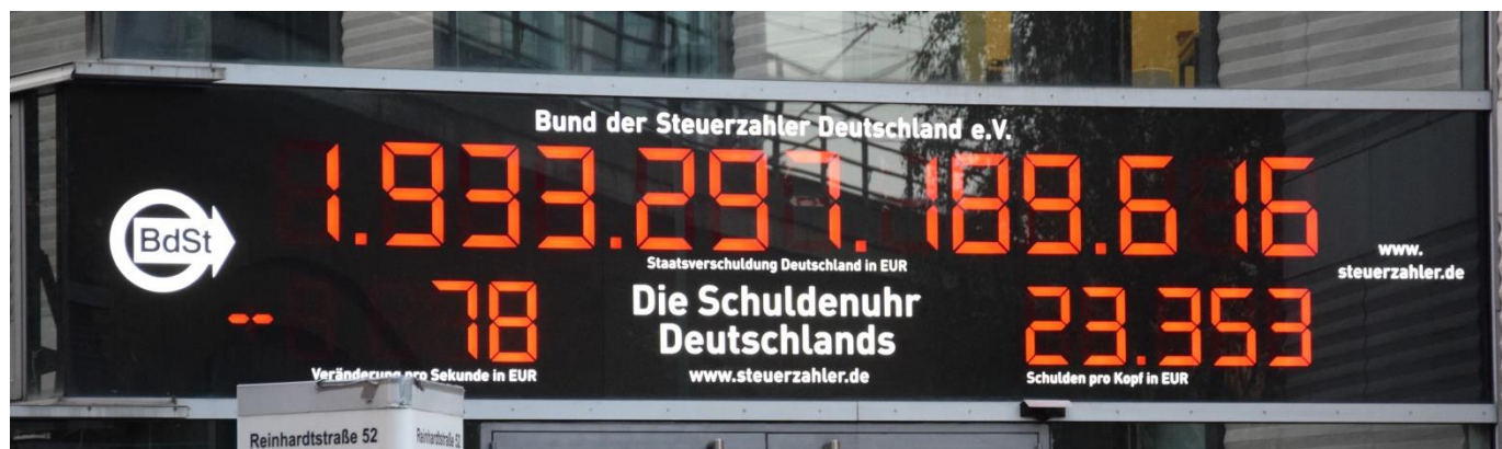
Everybody walking in Berlin on Reinhardtstraße an any moment can realize in real time the public debt in Germany.