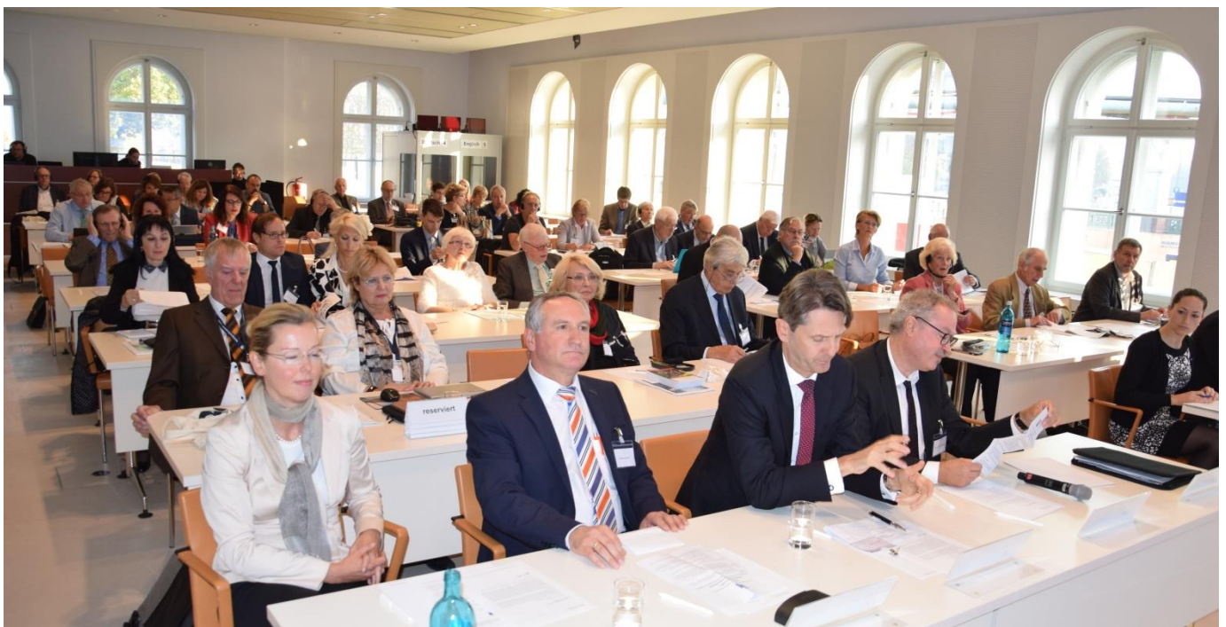
EJCongress' participants in the Bertlesmann Stiftung in Berlin.

As the main title of our congress reminds us, "There is a lot at stake" that we should tackle to shape the future of our beloved Europe.