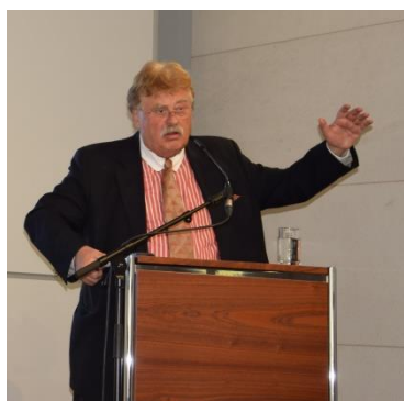
Elmar Brok, MEP.